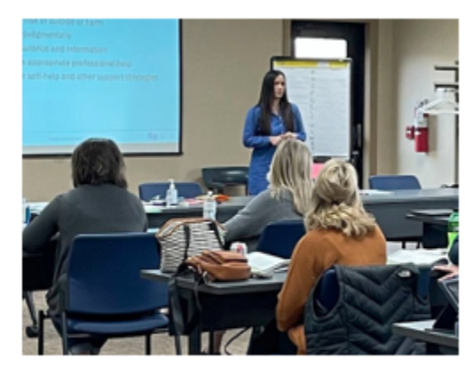
Ripley County teachers participate in Youth Mental Health First Aid training at the Southeastern Career Center in Versailles, IN, in early March 2021.

This spring, EI-AHEC's Mental Health First Aid training initiative will include a youth-specific Mental Health First Aid program for groups of teachers as well as regular Mental Health First Aid for Nursing and Human Services students at Ivy Tech Richmond. From there, we will continue to offer Mental Health First Aid training to targeted groups of health professions college students and working professionals in our region to help them better support the patients, clients, and students they serve and better collaborate with the behavioral health professionals who work in our region.